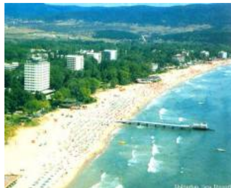
Here is one of the beaches of Varna