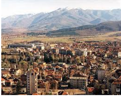
View to Berkovitsa

The largest part of the area is a hilly mountain terrain, very often cut through by ravines.