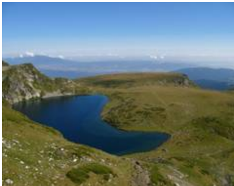
This is one of the famous Seven Rila Lakes.

Even though it is a small country (nearly 111 000 sq. km.) the natural landscape is magnificent and there are some gorgeous mountain ranges, actually 50% of Bulgaria is made of mountains, and we have the famous coast line – the Black Sea. This variable nature attracts a lot of tourist, because there is something for everyone.