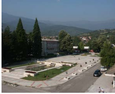
The main square