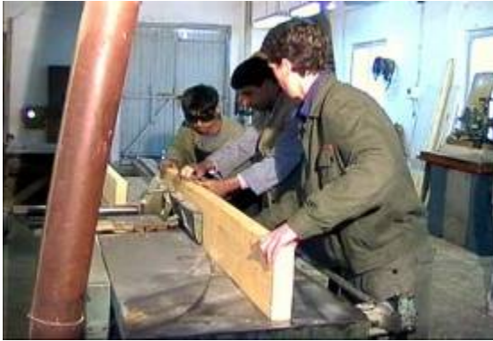
A carpentry work shop

Our project now includes 23 orphanages whereby we establish sustainable workshops in order to assist with Social integration and to provide an income. Items are made such as beds, bedding etc to assist the smaller more vulnerable orphanages.