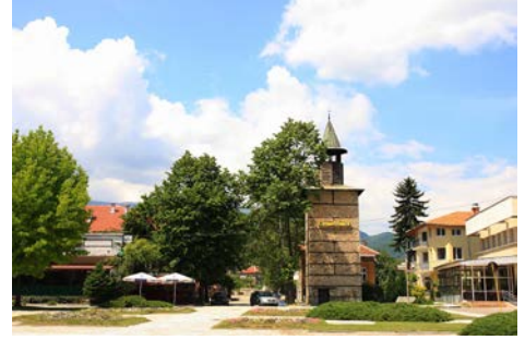
The Clock tower

Berkovitsa is an old settlement. This is proved by the remains of a fortress and a church from the 4th century, situated on the top of Kaleto hill. The town is famous from the time of king Kaloyan (the beginning of 13th century). The town is first mentioned in a written document from 1491. During the Ottoman rule it is developed as a craft center- mainly woodworking and pottery.