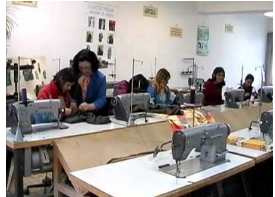
A tailoring Workshop

Such items as beds, bedding, mattresses & clothes are produced for the more vulnerable homes.